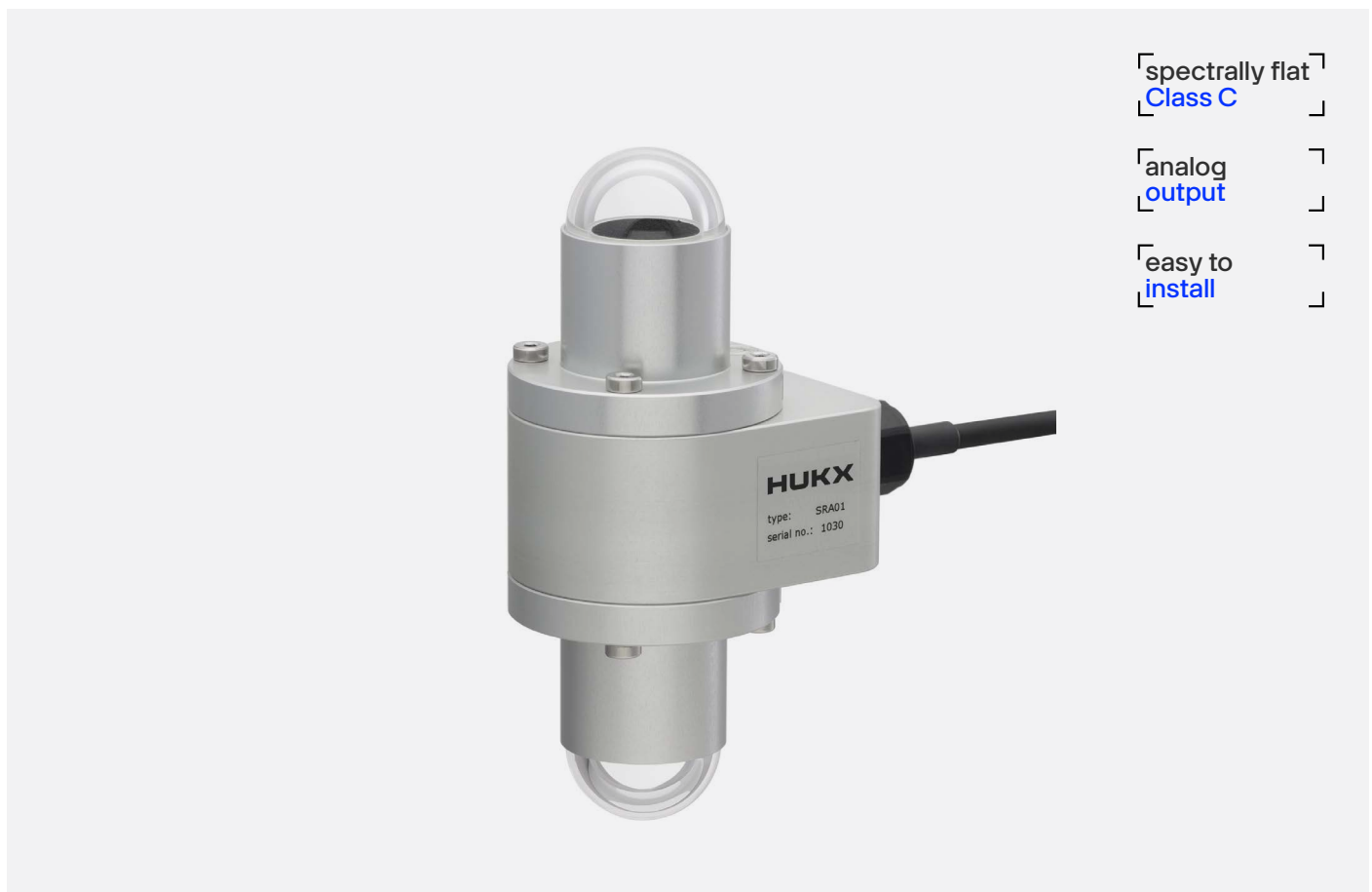
Figure 1 SRA01 spectrally flat Class C albedometer.

Albedo can be measured using the SRA01 albedometer. Using the SRA01 is easy. The albedometer is composed of two pyranometers (model SR01): the upfacing one measures global solar radiation and the downfacing one measures reflected solar radiation. The irradiance in each direction ( W/m^2 ) is calculated by dividing the pyranometer output, a small voltage, by its sensitivity—which is provided on the SRA01 product certificate. Albedo is calculated by dividing the two results.