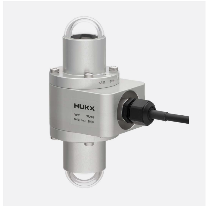
Figure 3 SRA01 Class C albedometer, designed to fit a 3/4 inch NPS mounting tube.

Please note that the mounting tube is not included. Optional longer cables and sun screens are available when ordering.